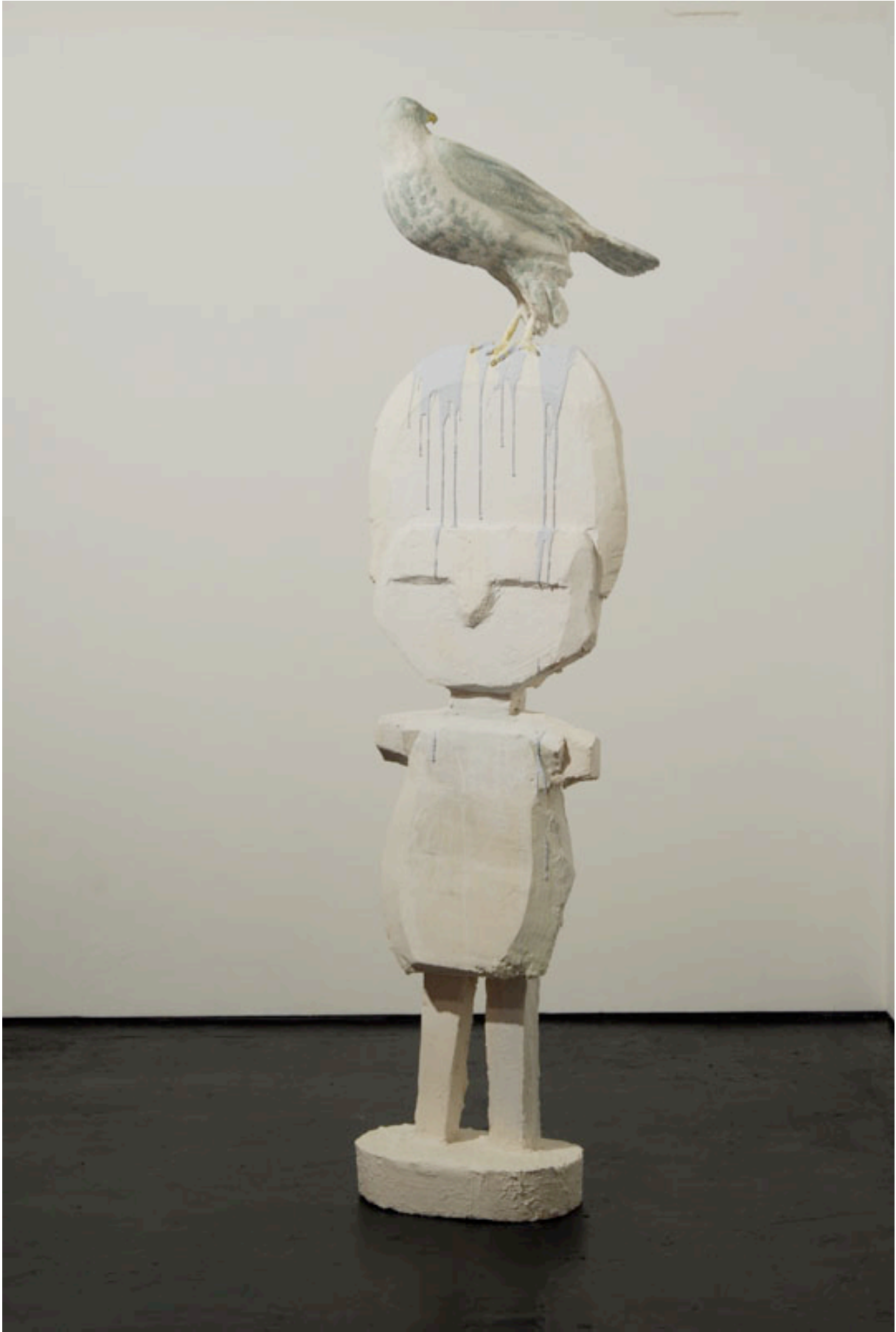
Mick Peter, Messiaen's Ornithological Transcription , 2008