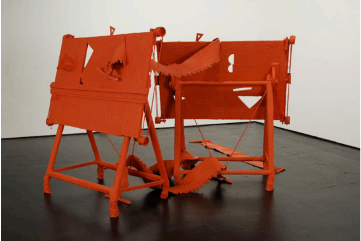
Mick Peter, Untitled (Tables) , 2008.